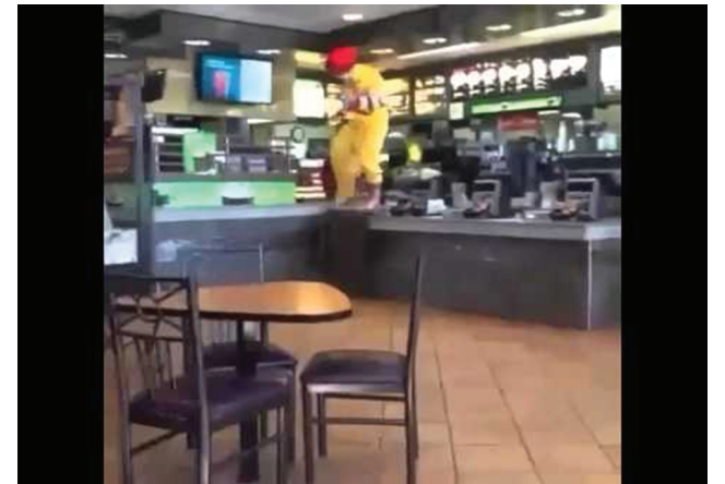
Step 1 (image: You Tube)