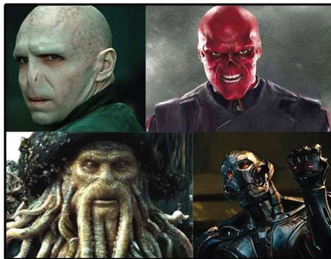
Bad guys dont deserve a nose